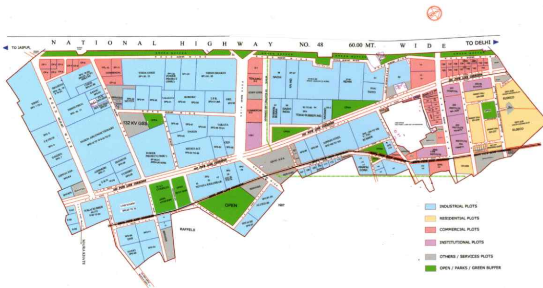
LAYOUT PLAN OF NEW INDUSTRIAL COMPLEX (MAJRAKATH) NEEMRANA (JAPANESE ZONE)

28 Plots of different sizes ranging from 3400 sqm. to 97600 sqm. are vacant in Japanese Investment Zone, Neemrana